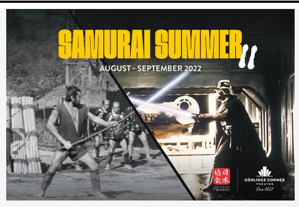
August - September, 2022 The Coolidge Corner Theater and the Japan Society of Boston Present