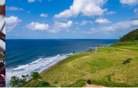
白米千枚田 - Shiroyone Senmaida Rice Fields

The Shiroyone Senmaida (meaning 1000 white rice paddies) are rice fields located on the northern side of the Noto Peninsula on a steep slope facing the Sea of Japan. "The area of each rice terrace is as small as 18m², and the difference in elevation is about 50m, making it impossible to use large agricultural machinery" ( source ).