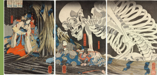
Takiyasha the Witch and the Skeleton Spectre by Utagawa Kuniyoshi