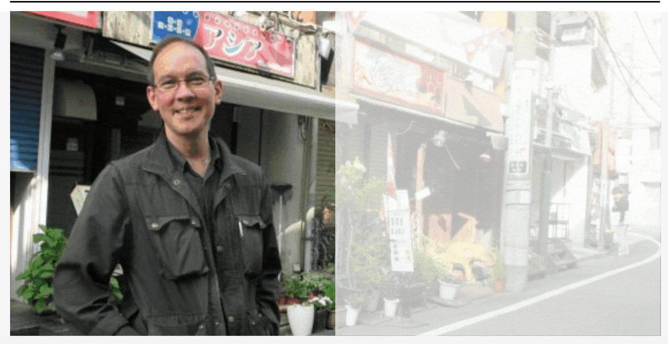
Watch your email inbox for Roland's next Letter from Tokyo on February 25th.