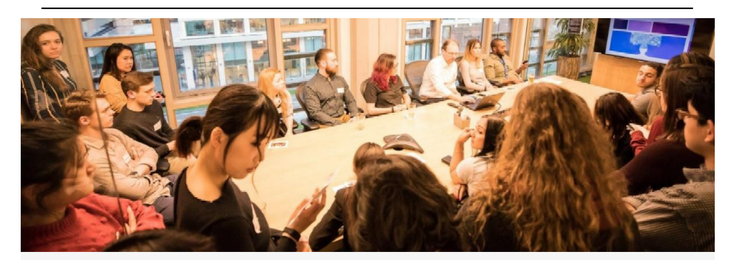
Global Cooperation on Medical Advancements February 17th 4 P.M. - 8 P.M. EST

Using the booming biotech industries in Boston and Japan as case studies, this virtual conference will address the obstacles and opportunities in global collaboration.