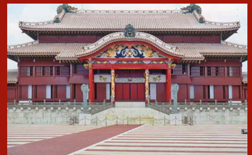
Shuri Castle, Naha, Okinawa

Kokusai-dori, Naha - Shopping & Entertainment Street