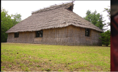
二風谷アイヌ文化博物館 - Nibutani Ainu Culture Museum

The Ainu are an indigenous people who have lived in Japan for thousands of years and can trace their history way back to before the Japanese came to the islands. Now, the Ainu live primarily in Hokkaidō, and this museum is dedicated to preserving their culture.