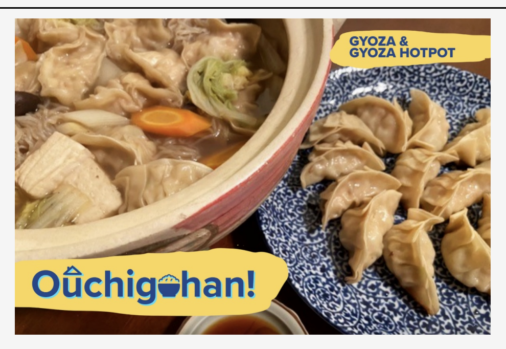
Saturday, February 11th, 2023 - 5:00 PM EST Online